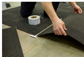
B.1 Position the next module