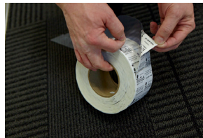
A.1 Peel the TileTab from the roll

D) See www.jjflooringgroup.com/tiletabs/ for additional installation videos.