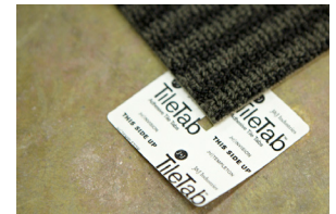
A.3 "THIS SIDE UP" facing up