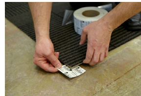
A.2 Place under the module