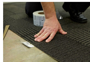
B.2 Press it into place