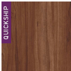
0780 Sugar Ma...