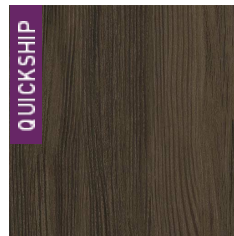
0830 Weathered ...