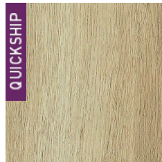
4006 Key Largo