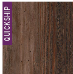
0820 Rustic Lo...