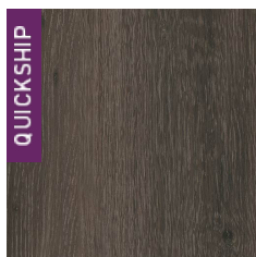
008 Suede Gray