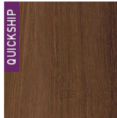
004 Autumn Leaf