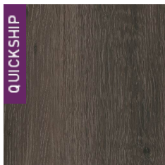
008 Suede Gray