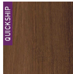
004 Autumn Leaf